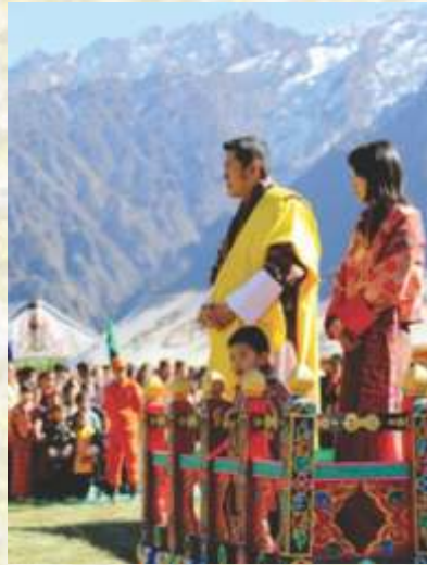
His Majesty The King, Her Majesty The Gyaltsuen, and His Royal Highness the Gyalsey graced the Silver Jubilee celebration of Gasa as a Dzongkhag (District). Gasa used to be a part of Puna Kha Dzongkhag until 1992.