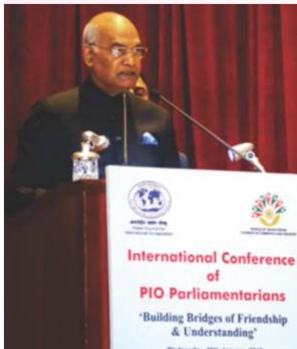
The President H. E. Shri Ram Nath Kovind