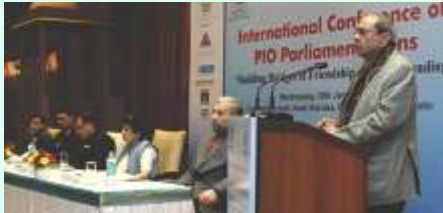
Amb. Shashank on the podium, addressing PIO Parliamentarians

Hon'ble Minister of Industrial Development of Uttar Pradesh Shri Satish Mahana in his inaugural speech highlighted the strong potential that Uttar Pradesh has as one of the most attractive state for Trade and Investment today. Various sectors for investment were highlighted during the presentation and contribution of Uttar Pradesh to the GDP of India was talked about. It was explained by the Hon'ble Minister how reforms have been introduced by the Government in Uttar Pradesh to accelerate trade and investment. He said that everyone can today agree that there is a change now in the perspective of looking at Uttar Pradesh. Recently, the Government has taken up many new initiatives like establishment of new airport, upcoming expressways and highways and improving law and order situation.