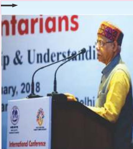
MoS for Finance Shri. Shiv Pratap Shukla can definitely work with them to take this friendship forward.