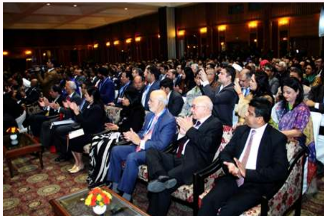
PIO Parliamentarians & Mayors

The President of India, Shri Ram Nath Kovind, inaugurated the International Conference of PIO Parliamentarians organised by Antar Rashtriya Sahayog Parishad - Bharat in association with the PIO Chamber of Commerce and Industry and the Ministry of External Affairs, Government of India, in New Delhi on January 10, 2018.