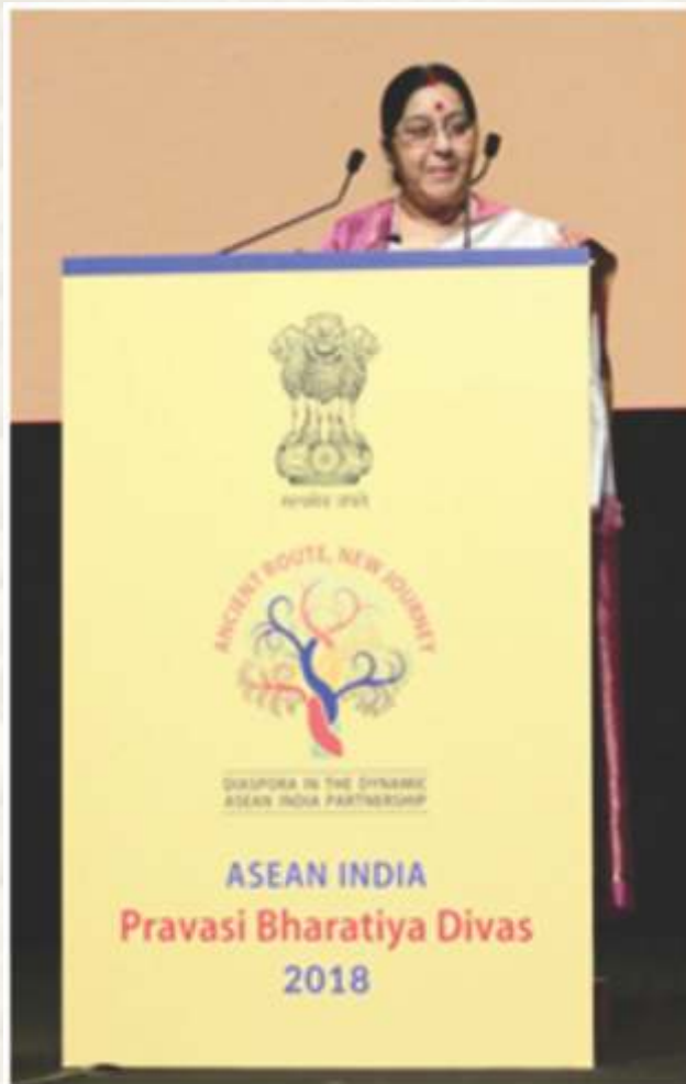
Opening address at ASEAN India Pravasi Bharatiya Divas by EAM Smt.Sushma Swaraj

"As India's economy grows its ties will deepen, its trade and investment flow will grow," she said, emphasising that ASEAN was a part of India's Act East Policy.