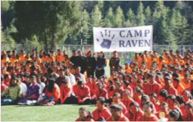
Her Majesty The Gyaltsuen graced the closing ceremony of Camp Raven, and awarded prizes to winners of various competitions held during the camp on 31 December 2017.