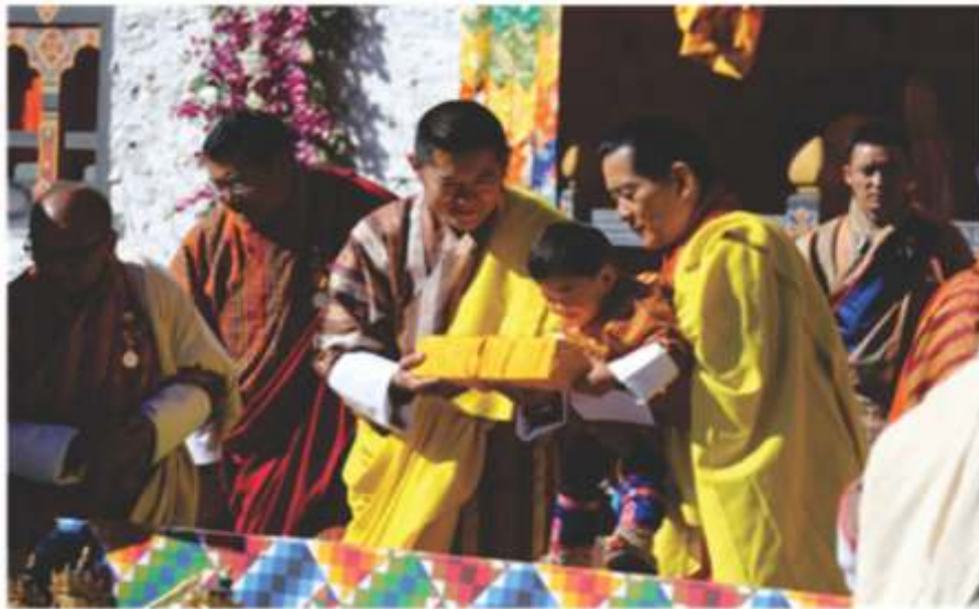
His Majesty The King, His Majesty the Fourth Druk Gyalpo and HRH The Gyalsey during the 110 th National Day celebration in Haa.

Thousands of people gathered at the courtyard of Lhakhang Karpo to partake in the celebration.