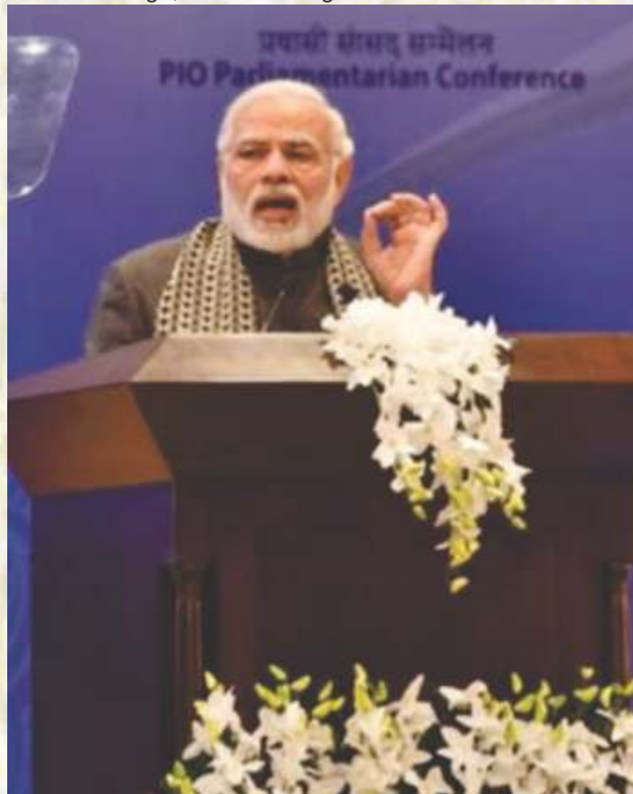
Prime Minister Narendra Modi addressing the PIO Parliamentarians

The Prime Minister said that the global impression about India has changed over the last three to four years. He said the reason for this is that India is transforming itself and the hopes and aspirations of India are at an all time high, therefore signs of irreversible