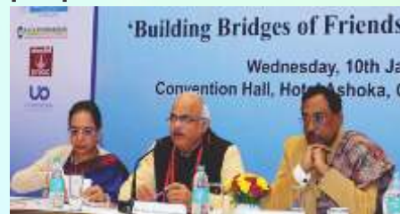
R to L: Amb. Pavan Varma,