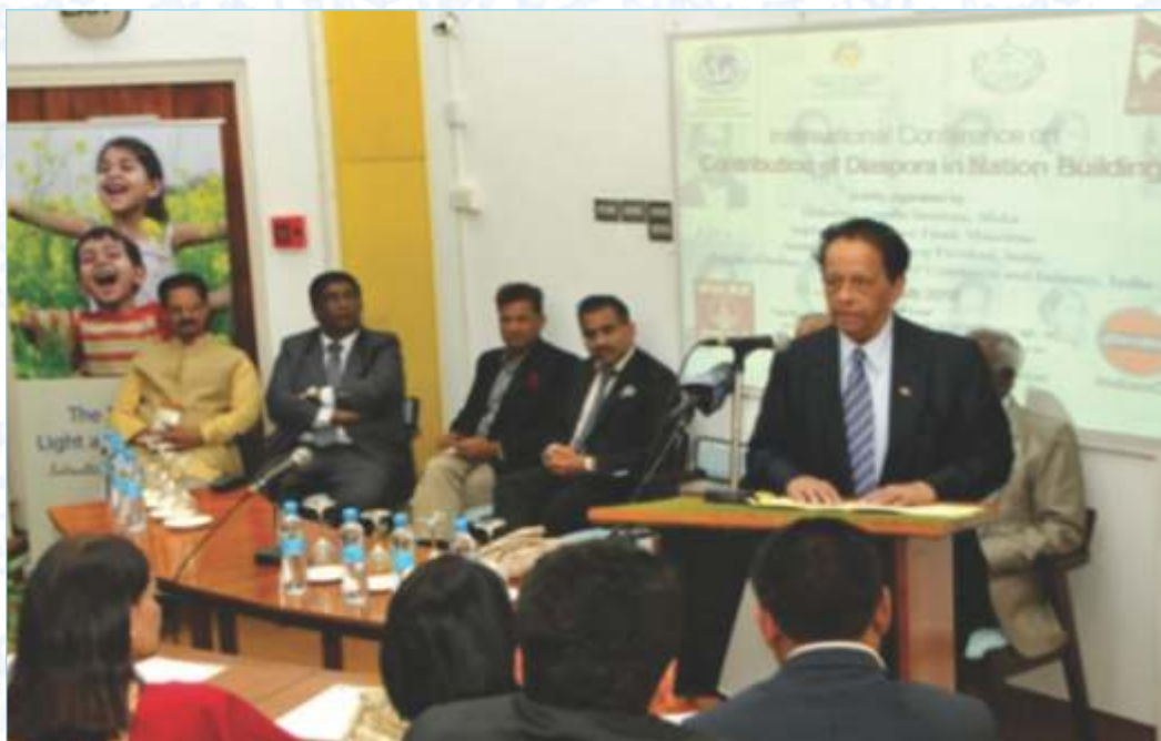
The Minister Mentor, Minister of Defence and Minister of Rodrigues, Sir Anerood Jugnauth inaugurating the International Conference

A two-day international conference, focusing on the contribution of Indian Diaspora in nation building in Mauritius, kicked off on 5th July, 2018 at the Mahatma Gandhi Institute in Moka. The conference was organised as part of the Antar Rashtriya Sahayog Parishad (ARSP) India's commemoration of the centenary of the abolition of indentured system and the celebrations to mark the 50th anniversary of the independence of Mauritius.