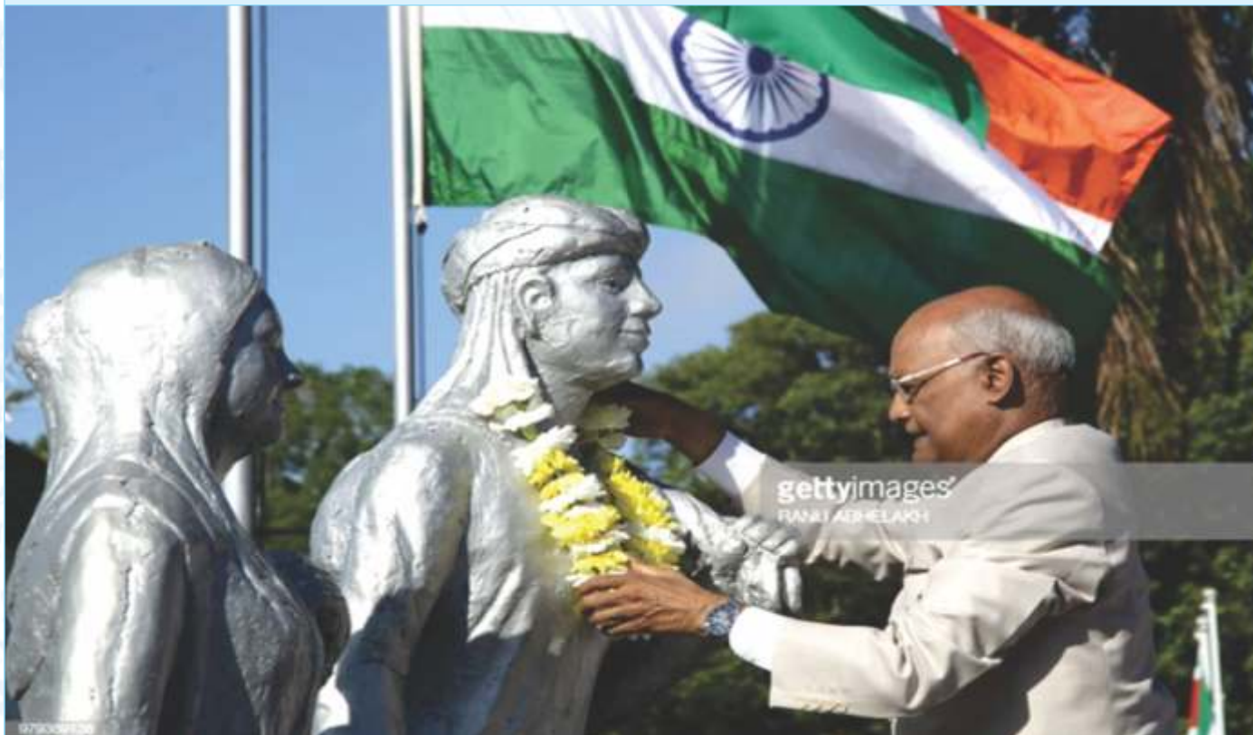
President Ram Nath Kovind garlanding the statue of Mai Baap at Suriname

President Kovind visited Suriname (June 19-21, 2018) to commemorate 145 th anniversary celebration of the arrival of first group of Indians as indentured labour. Today, almost 37% of the total population of 5,73,311 is of Indian origin.