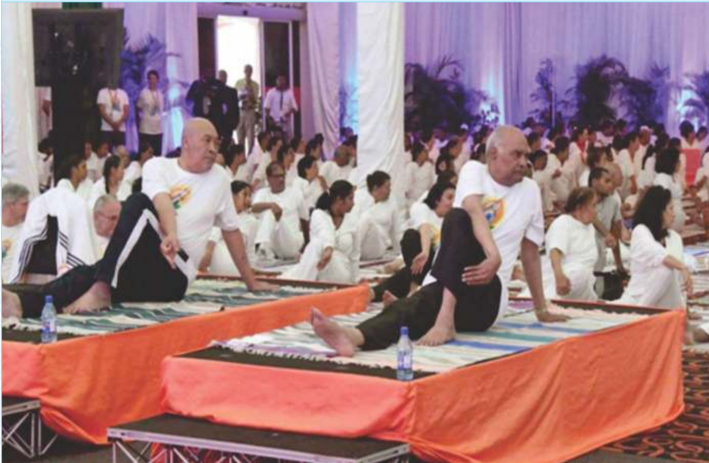
President Ram Nath Kovind performs 'asanas'

“भाइयों और बहनों”, आप सब से मिलकर मुझे सचमुच बहुत खुशी हो रही है। यह बड़े ही सम्मान की बात है कि आपने यहां हिन्दी को जीवित रखा है। मैं गर्व से कह सकता हूँ कि इस नाते आप सब सूरीनाम में भारत की भाषा और संस्कृति को यहां के विभिन्न समुदायों के बीच फैलाने का काम बखूबी कर रहे हैं। इस प्रकार आपने अपने पूर्वजों की स्मृति को भी जीवित बनाए रखा है। इसके लिये आप सब बधाई के पात्र हैं। मैं आप सबसे आग्रह करता हूँ कि इस कार्य को इसी तरह जारी रखिए। मैं कामना करता हूँ कि यह उत्साहपूर्ण वातावरण सदैव कायम रहे।