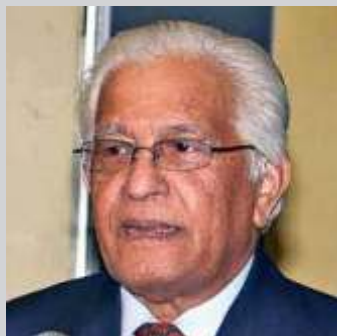
Shri Basdeo Panday (1933 –2024)