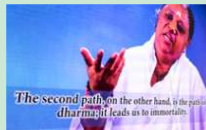
Honorable Chair of the Civil20 (C20) Mata Armitanandamayi

known as “Amma” the Hugging Saint. The Global Peace Leadership Conference Indo-Pacific 2023 was convened in cooperation with the C20. Amma inspired all the global delegates to be selfless and compassionate in a world full of greed and injustice. In her message she urged everyone to oppose evil ideologies and extend a helping hand to those in need and hope that each one of you will become Peacebuilders in your respective spheres of influence and join with us in the great movement for global peace,” said Dr. Hyun Jin Preston Moon, Chairman, Global Peace