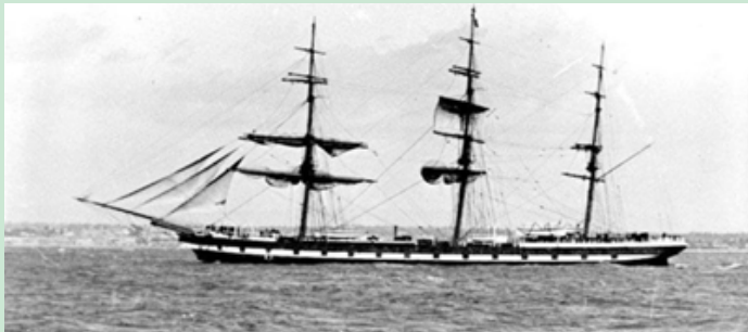
By Stabroek News : May 6, 2023 :

Berbicians who turned out yesterday at Highbury, East Bank Berbice to celebrate Arrival Day were assured by India's High Commissioner to Guyana, Dr K J Srinivasa that the relationship between the two countries remains strong as the governments are continuously working to strengthen the partnership.