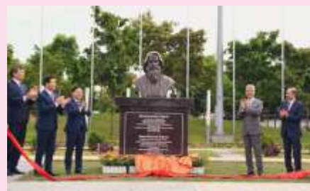
Gandhi's Bust in Ho Chi Minh City.

During his visit, Jaishankar will also travel to Hanoi and Ho Chi Minh City, holding talks with Vietnamese leadership, meeting the Indian community, and unveiling Mahatma