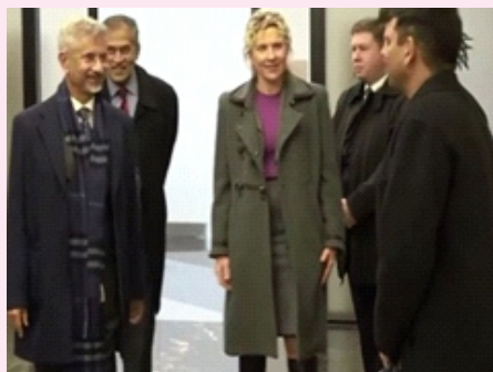
EAM S Jaishankar arrives in Moscow

External Affairs Minister S Jaishankar arrived in Moscow as a part of his two-day visit to Russia on 7 November 2022. During the visit, Jaishankar will be holding talks with Russian Foreign Minister Sergey Lavrov, in continuation of the regular high-level dialogue between the two sides. During the EAM's visit, talks between the two sides are expected to cover a range of bilateral issues and exchange of views on various regional and international developments.