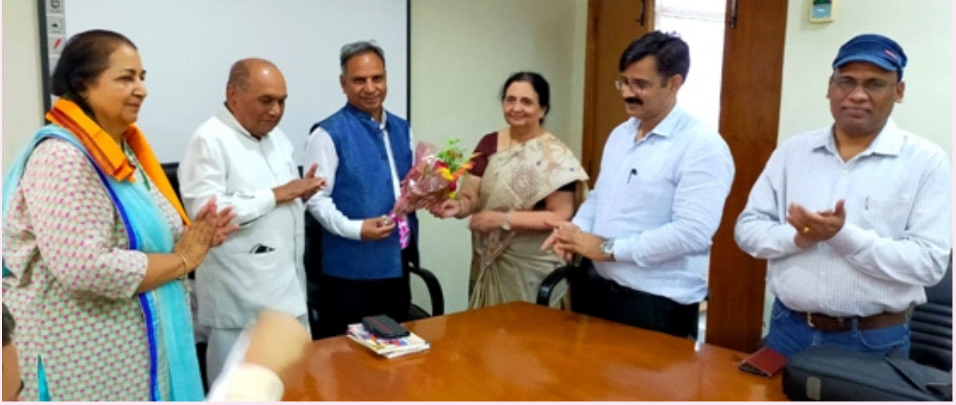
दिल्ली केंद्र पर प्रवासी साहित्यकारों का स्वागत।