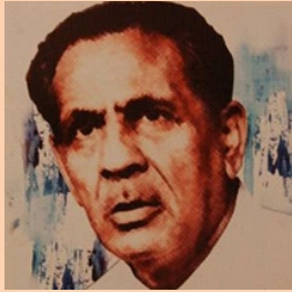
फिराक़ गोरखपुरी (28 अगस्त 1896 - 3 मार्च 1982)

रघुपति सहाय "फिराक़" (28 अगस्त 1896 - 3 मार्च 1982), उन्हें उनके शायरी के उपनाम "फिराक़" गोरखपुरी से अधिक जाना जाता है, उर्दू भाषा के प्रसिद्ध रचनाकार हैं। उनका जन्म गोरखपुर, उत्तर प्रदेश में कायस्थ परिवार में हुआ। रामकृष्ण की कहानियों से शुरुआत के बाद की शिक्षा अरबी, फ़ारसी और अंग्रेज़ी में हुई। बाद में फिराक़ साहब इलाहाबाद विश्वविद्यालय में अंग्रेज़ी के अध्यापक रहे और उर्दू भाषा में अपनी रचनायें कीं।