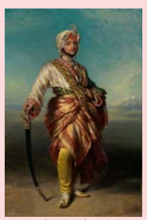
Maharaja Duleep Singh, the last ruler of the Sikh empire

Museum sets out on a mission to not only commemorate the remarkable legacy of Maharaja Duleep Singh but also to celebrate the enduring contributions of the Duleep Singh family to the cultural landscape of the United Kingdom.