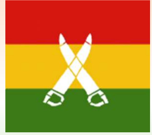
गदर पार्टी का चिन्ह

सन् 1913 में जब गदर आंदोलन आरंभ हुआ तो उसमें विदेशों में रहने वाले भारतवंशियों ने बढ़चढ़ कर भाग लिया। क्योंकि सभी का एक ही उद्देश्य था भारत माता को अंग्रेजी शासन से मुक्त करावाना। इसके लिए एक गदर अखबार निकाला गया, जिसमें क्रांतिकारी विचारों के लेख और कवितायें छपती थी। इन कविताओं को गदर की होने वाली सभाओं में जोश के साथ—साथ गाया जाता था। उल्लेखनीय यह है कि इन कविताओं की रचना करने वाले सिद्धहस्त साहित्यकार या कवि नहीं थे, लेकिन जब भी भारत की आजादी को लेकर उनके भीतर उत्साह उमड़ता तो उनका आक्रोश शब्दों में ढलकर कविता के रूप में अंग्रेंजी शासन के खिलाफ उमड़ता। इसमें अधिकतर कवि अज्ञात रहे उनमें से दो कवितायें यहां प्रस्तुत है।