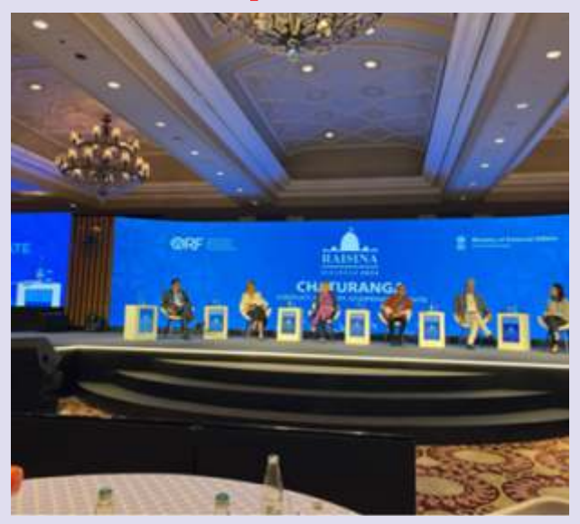
On his first foreign engagement as foreign minister, Lyonpo D.N. Dhungyel, Minister for Foreign Affairs and External Trade of Bhutan participated in Raisina Dialogue 2024.