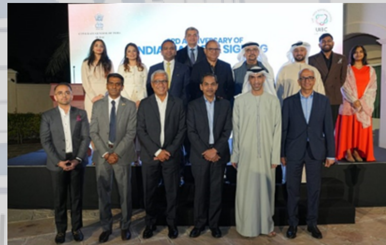
Dignitaries, industry leaders and government officials graced in the event

Economic Partnership Agreement (CEPA) and the second anniversary of the UAE Chapter of the UAE-India Business Council (UIBC) on February 28. The event saw the participation of key dignitaries, industry leaders, and government officials, reflecting the significance of the growing bilateral ties between the two nations.