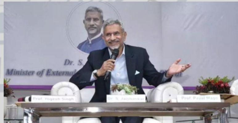
External Affairs Minister (EAM) S. Jaishankar at Literature Festival, University of Delhi

At the Delhi University Literature Festival on February 23, External Affairs Minister (EAM) S. Jaishankar captivated the audience with an insightful analogy, drawing parallels between foreign policy diplomacy and the epic Ramayan. He shared an intriguing perspective on international relations through the lens of Hanuman's mission to Lanka.