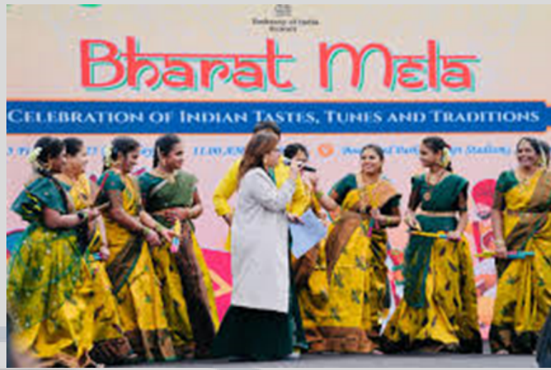
कुवैत में बुलीवर्ड क्रिकेट स्टेडियम, सालमिया में "भारत मेला" का आयोजन

कुवैत एक ऐसा खाड़ी देश जहाँ प्रवासियों के रूप में भारतीय समुदाय की संख्या सबसे अधिक है, जो कि अपने गरिमामय व्यक्तित्व और विश्वसनीयता के लिए विश्व भर में जाने जाते हैं और ऐसे देश में "भारत मेला" आयोजन ने न केवल विभिन्न भारतीय प्रदेशों के निवासियों के बीच में मित्रता और संबंध को मजबूती प्रदान की अपितु भारत और कुवैत के बीच के संबंधों में प्रगाढ़ता लाने का महत्वपूर्ण कार्य किया है।