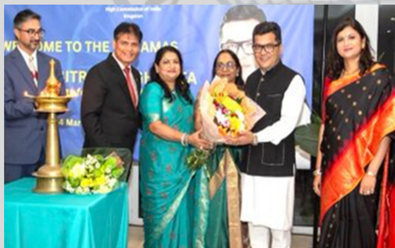
Union Minister of State for External Affairs, Pabitra Margherita at a diaspora event

Union Minister of State for External Affairs, Pabitra Margherita, engaged with the Indian diaspora in the Bahamas on March 3rd during his first-ever bilateral visit to the Caribbean nation. In a vibrant event celebrating the growing people-to-people (P2P) and cultural ties between India and the Bahamas, Margherita expressed his delight in connecting with the Indian community.