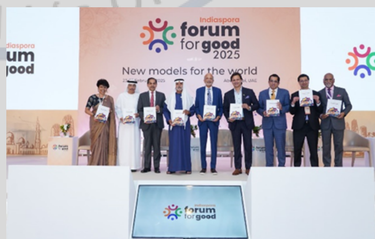
A landmark event took place in the UAE: the inaugural Indiaspora Forum for Good 2025.

A landmark event took place in the UAE, where the inaugural Indiaspora Forum for Good 2025 brought together over 100 distinguished leaders from around the world. Hosted from February 23 to 26, the four-day summit united global leaders of Indian origin to address pressing global challenges and explore impactful solutions across various sectors.